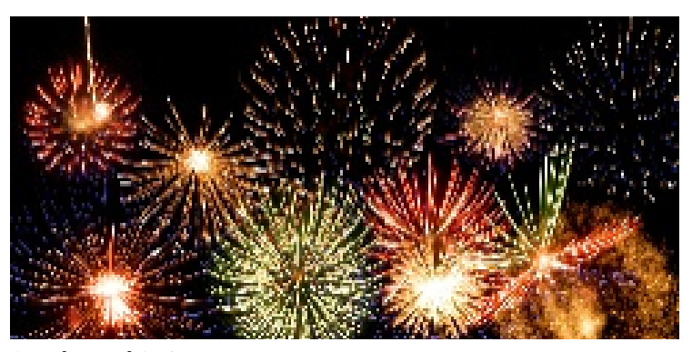
Sparks and Stripes July 3 & 4 Irving, TX

North Texas' Largest Boating and Recreational Event Returns. Dive into endless possibilities with the area's top dealers and exhibitors showcasing the best deals on the latest models of personal watercraft, fishing boats, pontoons, and must-have marine tech. The Dallas Boat Show also hosts community organizations, media partners, and exhibitors offering fun experiences for the whole family. For event hours and to purchase tickets, visit <u>https://dallasboatexpo.com</u>