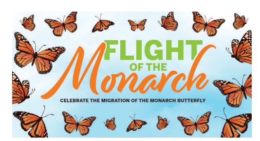
Flight of The Monarch Festival October 5, 2024 Grand Prairie, TX

Screams Halloween Theme Park is the ultimate Halloween experience in the D/FW Metroplex with 5 Haunted Houses and a whole lot more! Each haunted house has a unique theme and design and they are sure to find what makes you Scream! And there is so much more, which includes the Cool Ghoul Boolevard and Rottingwood Cemetery walk-through through attractions, exciting live stage entertainment, Scary-Oke, and games of skill for an entire night of Halloween fun. When you are ready to take a break, partake in some food & drink or shop for some great Halloween merchandise at the Screams shops. Those over 21 can also enjoy an adult beverage at one of the 5 pubs. All 5 haunted houses, the Cool Ghoul Boolevard, Rottingwood Cemetary, stage entertainment, and Scary-Oke are all included in your single admission price. To cut the wait times in half, there are a limited number of Fast Passes available each night. Screams is designed for ages 16+ and is not recommended for young children. Discount tickets available through your concierge. For more information visit www.screamspark.com